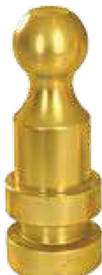
FL1005B 2 5/16" Ball