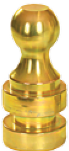
FL1005 2 5/16" Ball