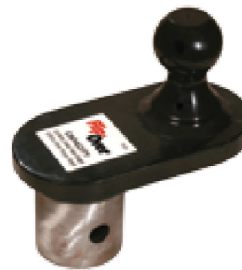
FL4 4" Offset 2 5/16" Ball