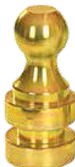
FL1005-3 3" Ball