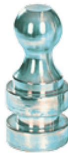
Stainless 2 5/16" Ball