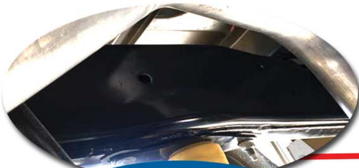
Picture shows 'No' inner side plates welded on frame. New Style